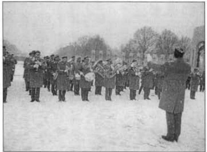
Belgian Royal Band of Guides Paying tribute at WWII Memorial