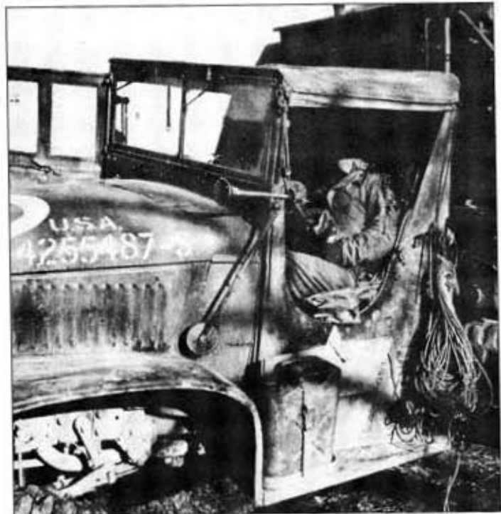
Driver and truck from the US 35 th Combat Engineers, hit by German air attack near Heiderscheid in December 1944

[Two days before the bombing of the 10 th Armored Division's aid station the Air Force dropped supplies of food and ammunition in parachutes. Renee asked us to save the parachutes so she could make a wedding dress because she was to be married after the war. We saved the parachutes and gave them to her.]