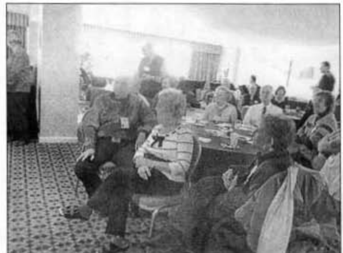
Hospitality Room (cont'd next page)