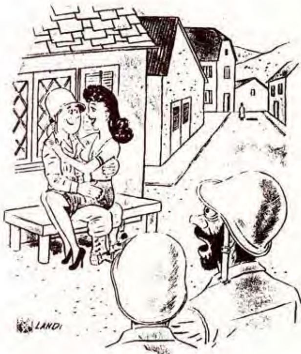
"DEBS GETS ALL THE BABES SINCE HE GOT RID OF 1700 SHADOW." —Pvt. Sidney Lumdi

One town that we went into had a sniper that we couldn't locate. Finally we went into a building and all we found were two women in the middle of the living room, rocking away in big rocking chairs—two little old ladies. One of these ladies had a big German rifle behind the door casing, and she would open that door case and get that rifle and kill a couple of boys and then she'd sit the gun back inside and close it down so that nobody could locate it.