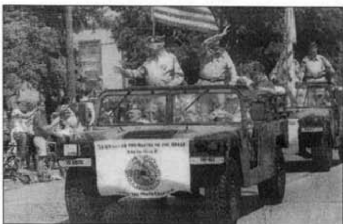
VBOB chapter leads the way!