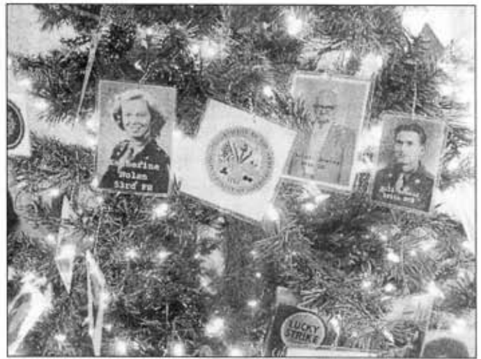
Christmas Tree in Hospitality Room