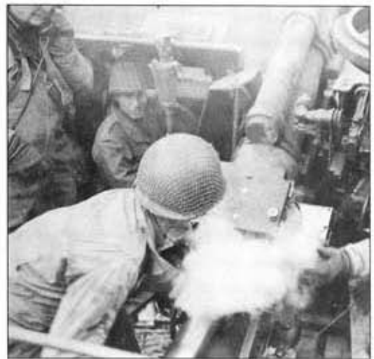
Crew of a 105mm self-propelled Tracked howitzer in action. This was the normal field artillery piece of the American armoured divisions.

A special thank you to the 34 veterans who attended. It is such a privilege to be in your company.