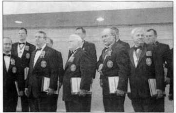
West Point Alumni Glee Club Performed at our Banquet