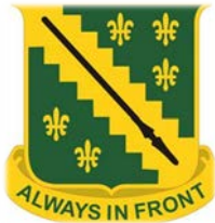
"New" 38 th Cavalry Crest