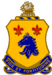
"Old" 102 nd Cavalry "Essex Troop"