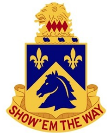
"Old" 117 th Cavalry Crest, "New" 102 nd Cavalry Crest